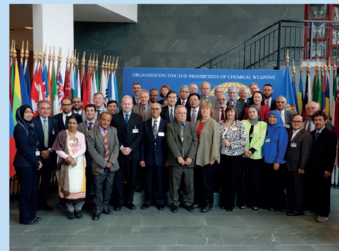
The Participants of the Second Workshop on Ethical Guidelines for the Practice of Chemistry under the Norms of the Chemical Weapons Convention (CWC).

More information is available at https://www.opcw.org/special-sections/science-technology/the-hague-ethical-guidelines/